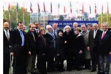
World ORT's Executive Committee outside the Council of Europe.

Leading officials at the Council of Europe during a meeting in Strasbourg praised ORT's contributions to European values of democracy and the rule of law through its work and philosophy.