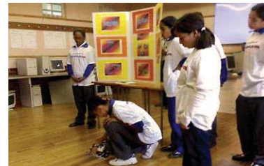
A girls-only team from Northwood Primary School demonstrates its robot design to judges. The team went on to become the overall winner.

ORT SEED, ORT South Africa's innovative program to bring science and technology education to under-resourced schools, is creating new opportunities in working-class townships. More than 50 students competed against each other to see which ones would try to win the First Lego League provincial contest in Cape Town.