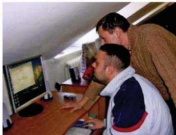
A trainee is introduced to computing at the Lawson ORT-Career Center in Beltsy.

Representing a strengthening of ORT's Science Journey, the school's conversion into a center for scientific and technological studies will serve 45,000 people, about half of whom are immigrants, as well as Rodman's own students and residents of nearby towns. Access to state-of-the-art laboratories and staff facilities – as well as teacher training and material support for poor students – will provide students with the tools they need to succeed, while encouraging them to achieve personal excellence.