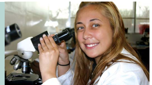
Corporate matching gifts can help ORT students in the U.S., like this Bramson ORT student.

Upon receipt of the employee's donation and employer matching gift form, the National Office will complete its section of the matching gift form and forward it on to the employer, requesting that a matching donation be made. In so doing, we are verifying to the employer that we have indeed received the employee's contribution. We will keep the employee informed of our actions. When the matching gift comes in (sometimes several months afterward), we will send an acknowledgement