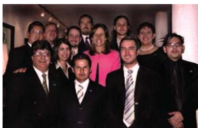
Mexico's First Lady, Margarita Zavala de Calderón, who has promised to inaugurate the three-day Congress, poses with ORT Mexico staff.

More than 2,000 educational professionals from across Latin America will attend a three-day Congress on educational innovation and technology, hosted by ORT Mexico. Believed to be the first time a pan-Latin American education event will be held, the Congress will enable attendees to share experiences, learn new teaching techniques from around the world, participate in 20 workshops and 16 conferences, and view exhibits on the latest school supplies, books and teaching materials.