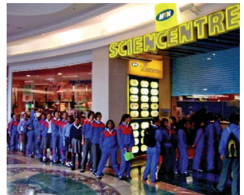
ORT SA students at the MTN Sciencentre

was apparent. They are working very diligently to deliver 21st Century science, math and technology to the youth of South Africa.