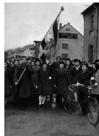
ORT trainees in the Bergen-Belsen Displaced Persons Camp, December 7, 1947.

The Documentation Center (funded by the German government) houses the results of seven years' intensive international research and covers the history of the Bergen-Belsen camps (concentration, prisoner-of-war and displaced persons camps). It includes material illustrating Bergen-Belsen's previously neglected post-war role as the largest Jewish Displaced Persons (DP) camp on German soil.